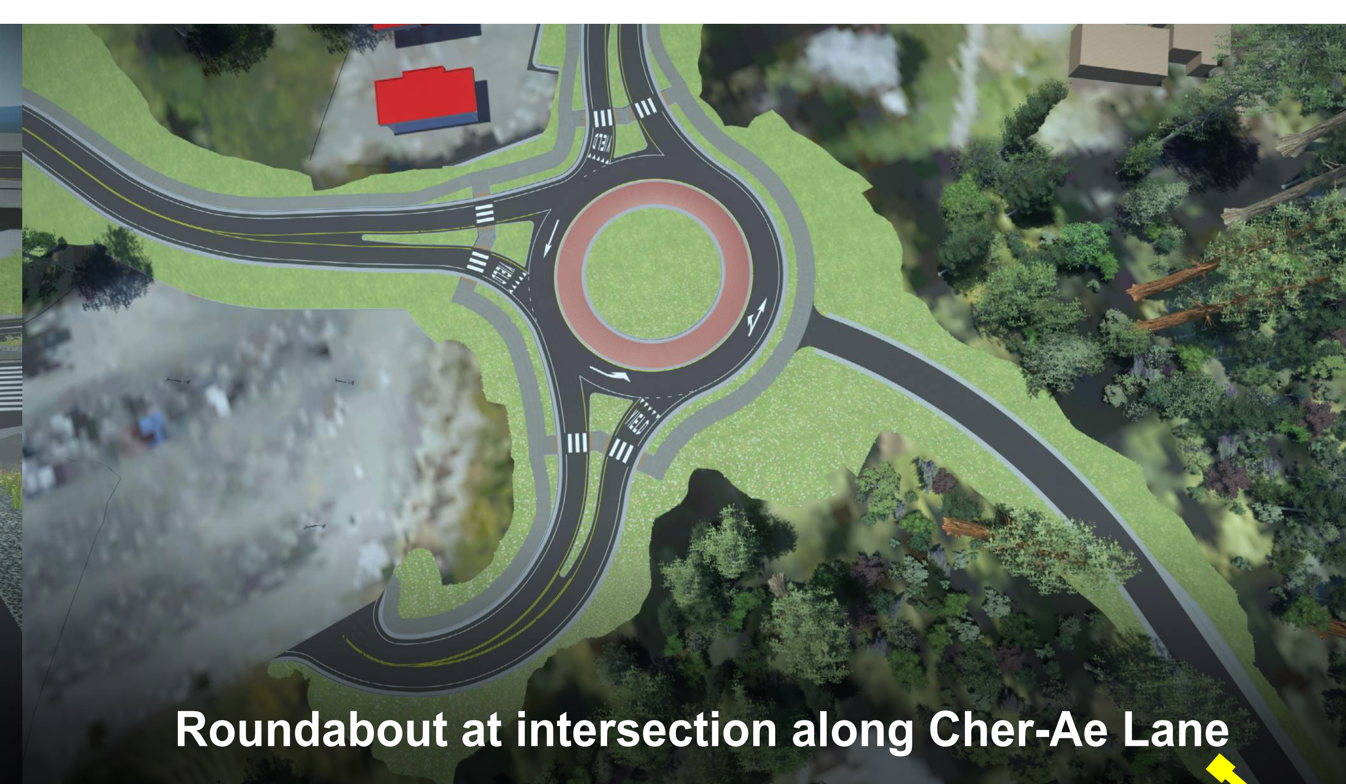
Roundabout at intersection along Cher-Ae Lane