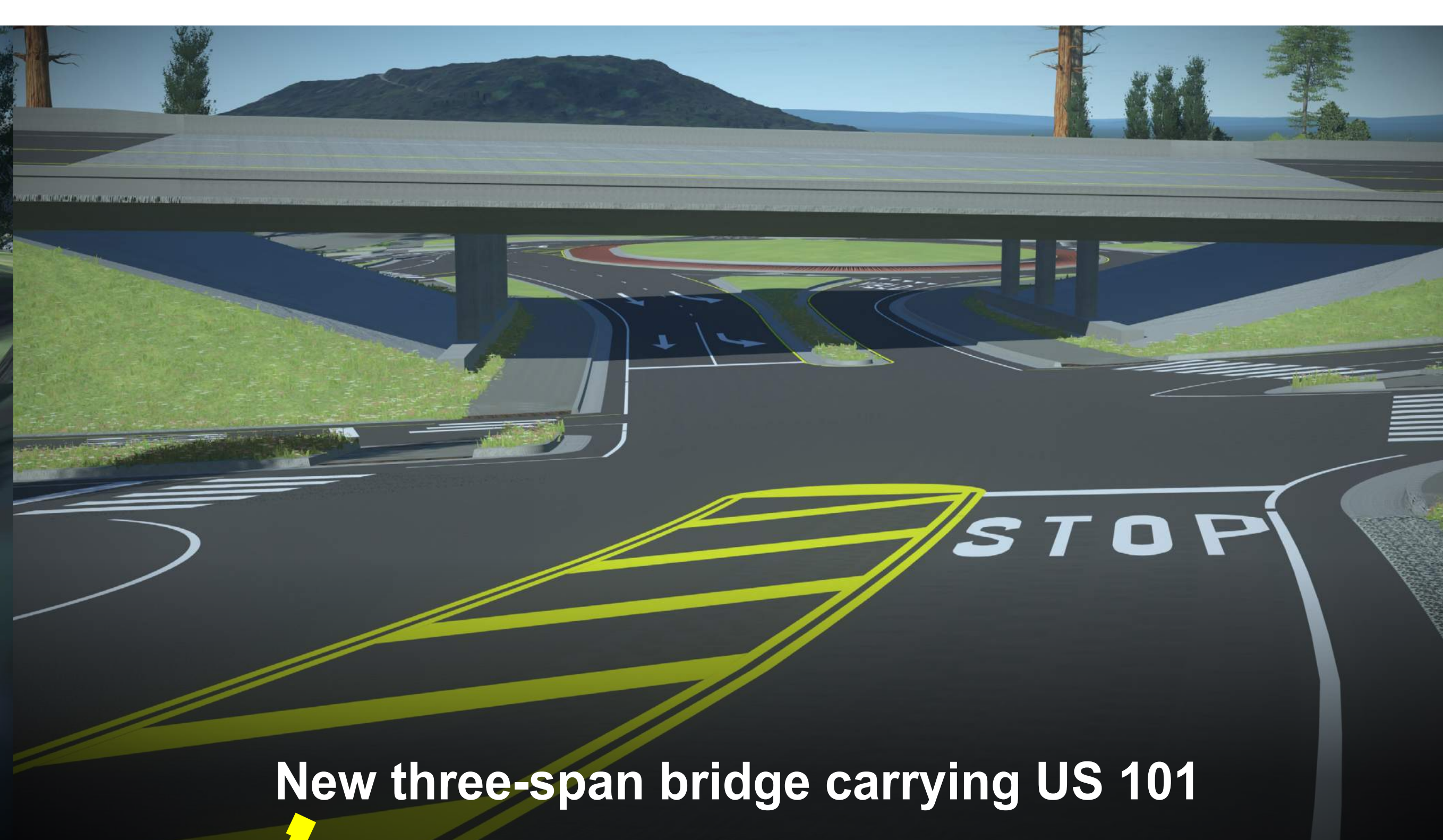
New three-span bridge carrying US 101