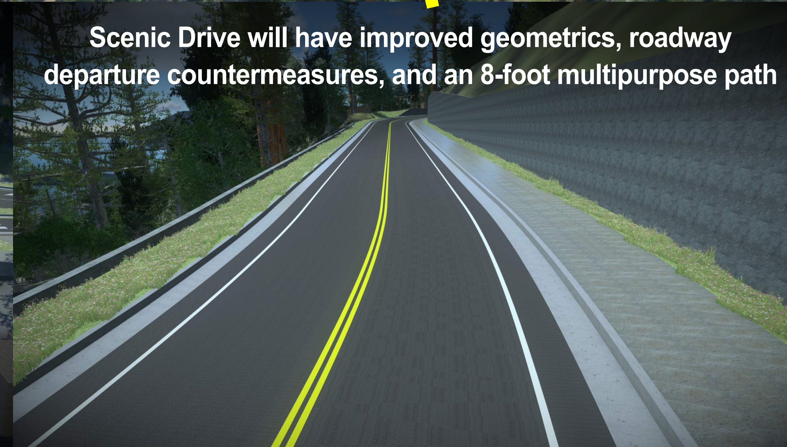
Scenic Drive will have improved geometrics, roadway departure countermeasures, and an 8-foot multipurpose path