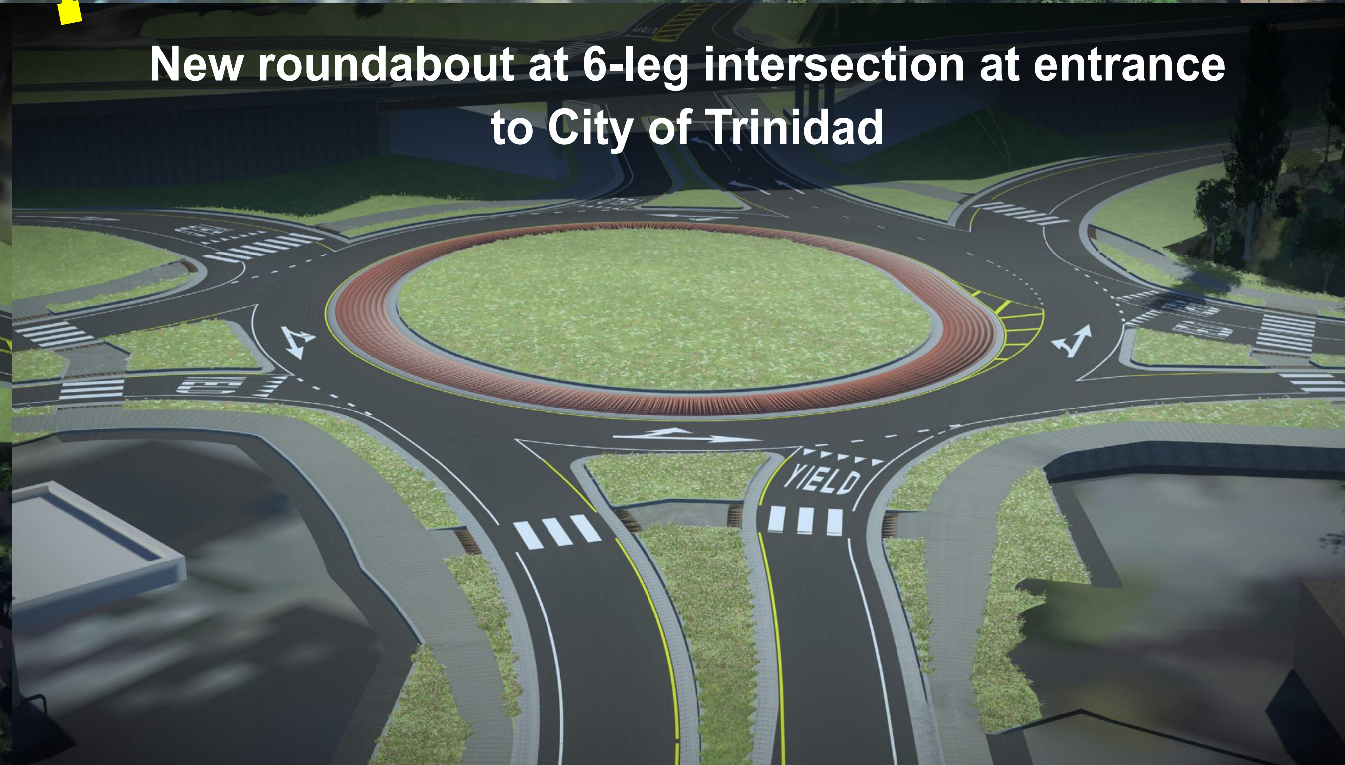
New roundabout at 6-leg intersection at entrance to City of Trinidad