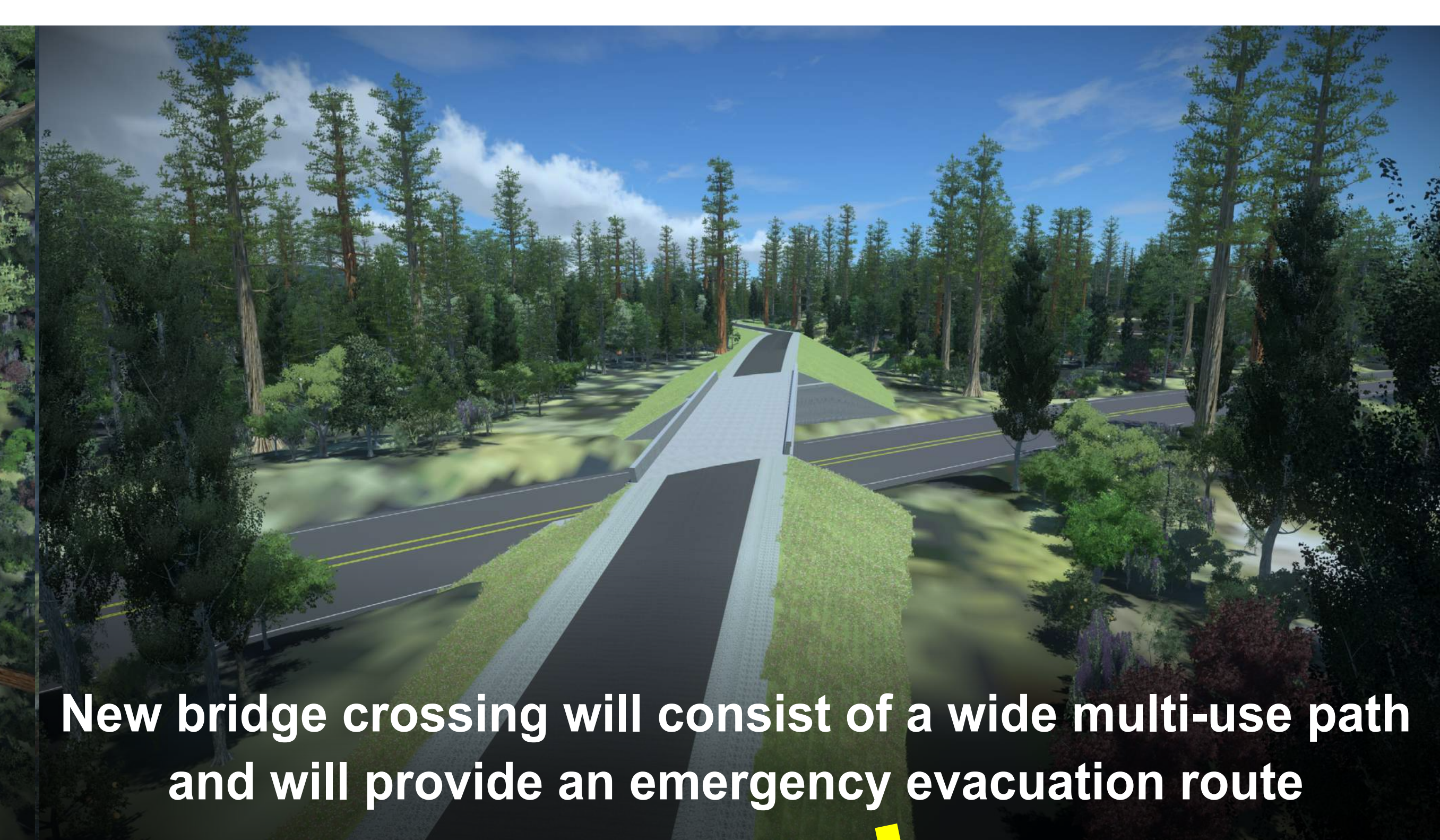
New bridge crossing will consist of a wide multi-use path and will provide an emergency evacuation route